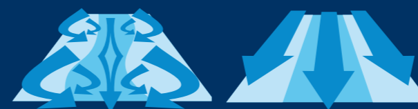
Typical Swim Jet or Swim Spa